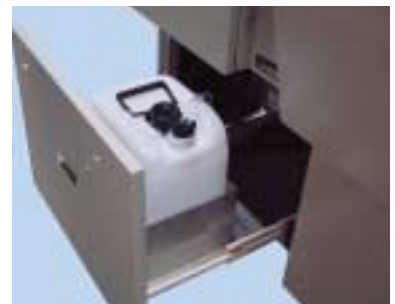
New, easily accessible water system.

Space requirement: 4 stations 2.1 x 1.0 m 6 stations 2.7 x 1.0 m