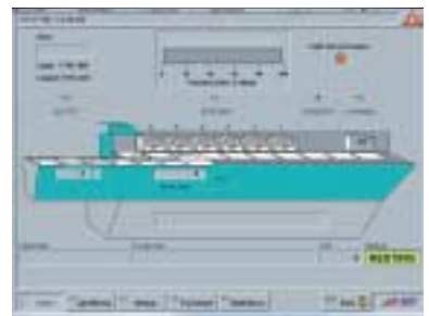
Improved Human-Machine Interface system.

Promail Ltd Units 12 & 13 Network 43 Buckingham Court Buckingham Road Brackley Northants NN13 7EU